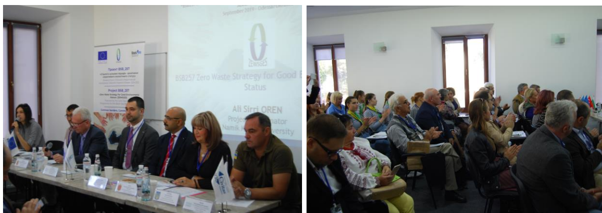
Figure 3. Project Meeting in Burgas-Bulgaria on 14-15 May 2019