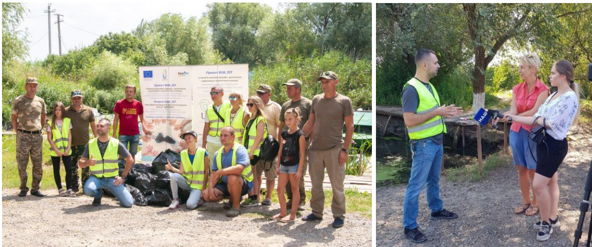
Figure 4. Fishing for litter campaign done by UKRMEPA in Odessa UKRAINE in August 2020.

Ukraine (UKRMEPA) did the fishing for litter campaign in August 2020 (see Figure 4) and the other three countries will do before December 2020. A total of 52 people took part in the action, who collected about 70 bags of garbage, weighing a total of 700 kg,