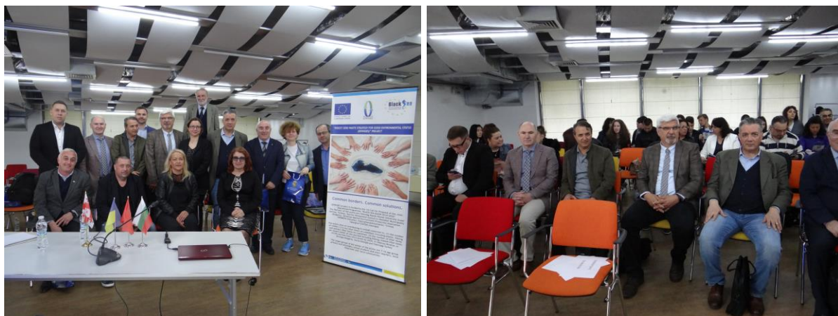
Figure 2. Project Meeting in Burgas-Bulgaria on 14-15 May 2019.

In the Project, 4 workshops, 4 conferences and press conferences, one in each partner country, were planned. Meetings on 14-15 May 2019 in Burgas-Bulgaria (Figure 2) and on 19-20 September 2019 Odessa- Ukraine (Figure 3) were held. The remaining two meetings to be held in Georgia and Turkey will be realised online via WEBINAR, in October 2020 and December 2020, respectively.